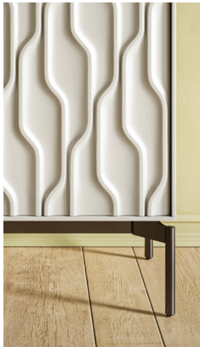
STONE & BRUSHED CARBON

Mesa cabinets are available in two finishes—Stone and Moss—and two base options—Brushed Brass and Brushed Carbon.