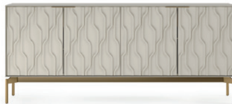
STONE & BRUSHED BRASS

Mesa cabinets are available in two finishes—Stone and Moss—and two base options—Brushed Brass and Brushed Carbon.