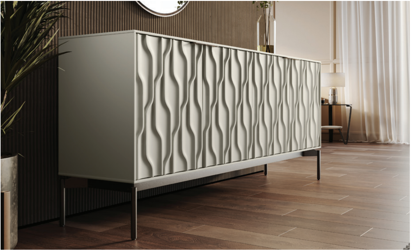
Stone with Brushed Carbon legs