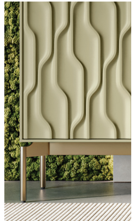
MOSS & BRUSHED BRASS