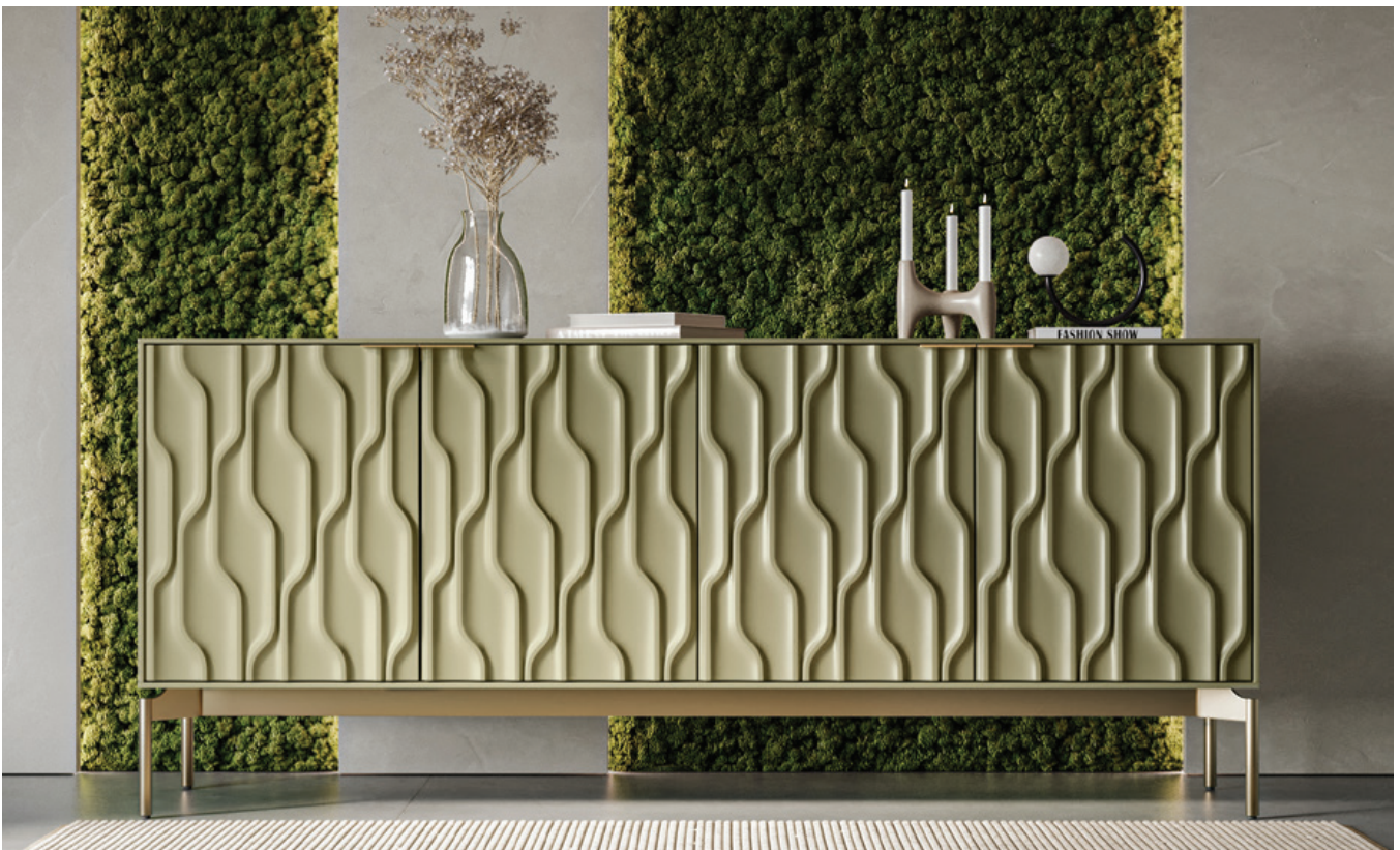
Moss with Brushed Brass legs